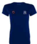
DE LA SALLE