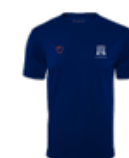
DE LA SALLE