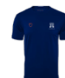
DE LA SALLE